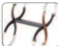
LSS-30 for LSF ladder LSS-32 for LSF ladder