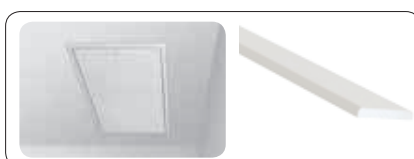
Wooden trim LXL-W

* concerning sizes: 22x31, 22x47, 22x54, 25x47, 25x54