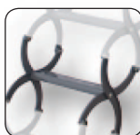
LSS-31 for LST ladder LSS-38 for LST ladder